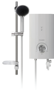
W/ White (Glossy)