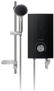
BK/ Black (Matt)