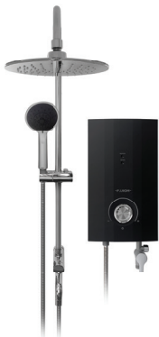
BK/ Black (Matt)