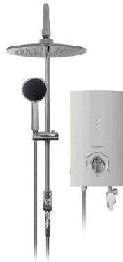
W/ White (Glossy)