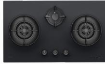
FH-GS6830 GLBK (Glossy)/ FGBK (Matte)