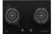
FH-GS6827 GLBK (Glossy)