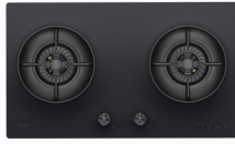
FH-GS6820 GLBK (Glossy)/ FGBK (Matte)

Product images are for illustrative purposes and may differ from the actual product